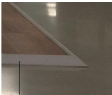
Raised floor (4cm) with sloping edges, finished with wooden laminate.

**For our reference, see below an image showing sloped edging.